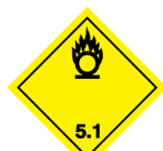
Class 5.1 HAZARD Oxidizing Substances

ADR , Annex A General provisions and provisions concerning dangerous substances and articles; Classification; Class Specific Provisions